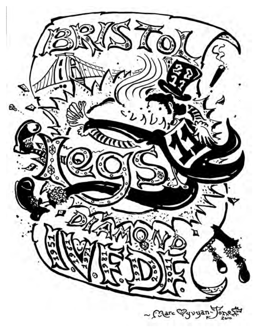
The IVFDF Symposium